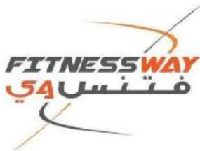
FITNESS WAY GYM