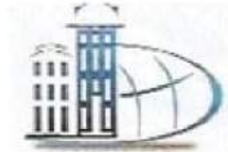
ALTAYYAR ALUMINUM & STEEL