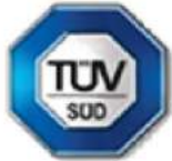
TUV SÜD MIDDLE EAST LLC