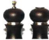
SALT AND PEPPER RESTAURANT